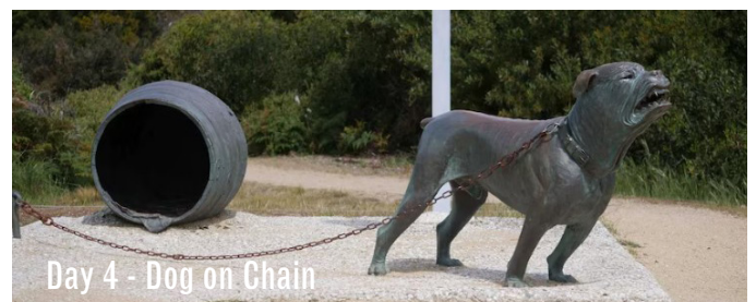
Day 4 - Dog on Chain