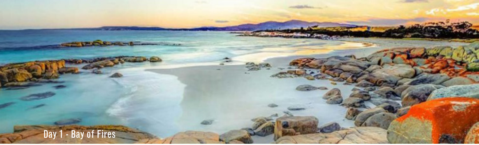
Day 1 - Bay of Fires