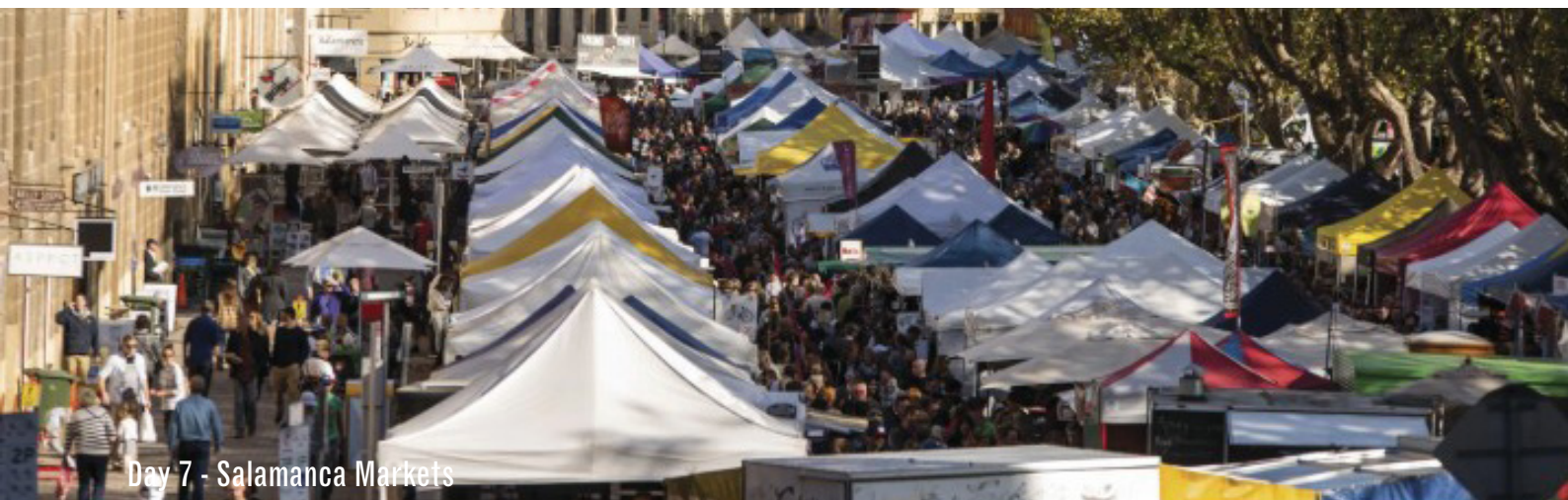
Day 7 - Salamanca Markets