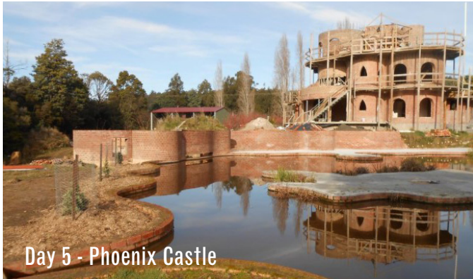
Day 5 - Phoenix Castle