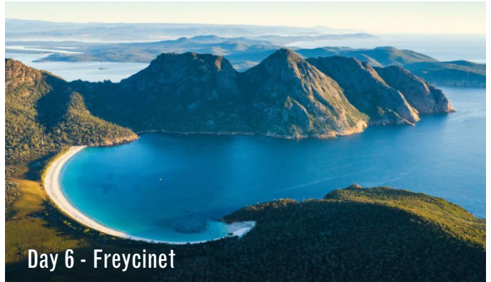
Day 6 - Freycinet