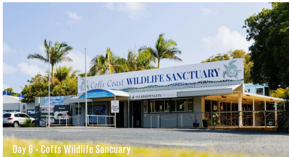
Day 6 - Coffs Wildlife Sanctuary