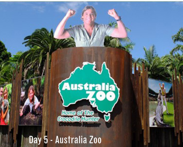
Day 5 - Australia Zoo