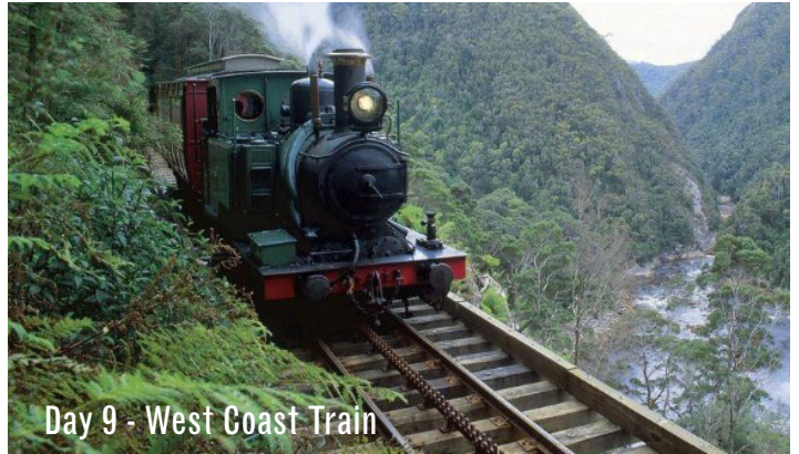
Day 9 - West Coast Train