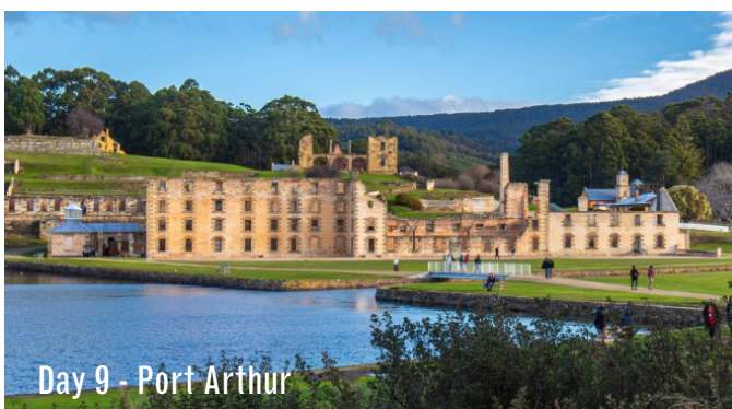
Day 9 - Port Arthur