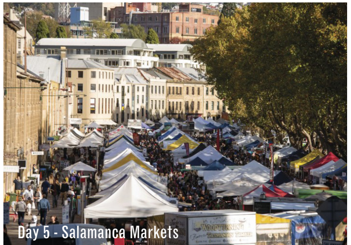
Day 5 - Salamanca Markets