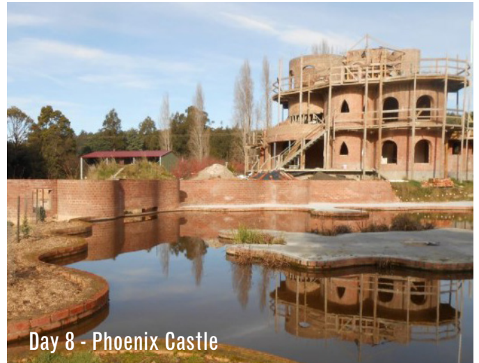
Day 8 - Phoenix Castle