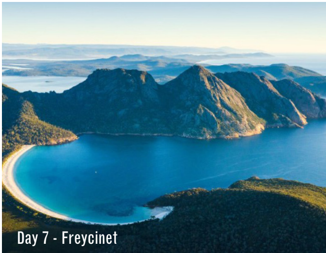
Day 7 - Freycinet