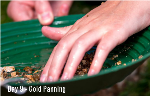
Day 9 - Gold Panning