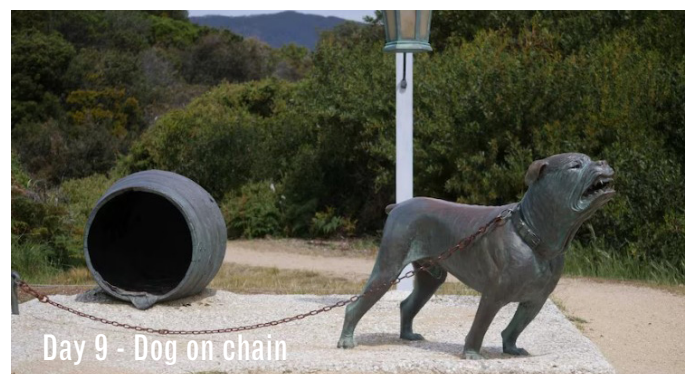
Day 9 - Dog on chain