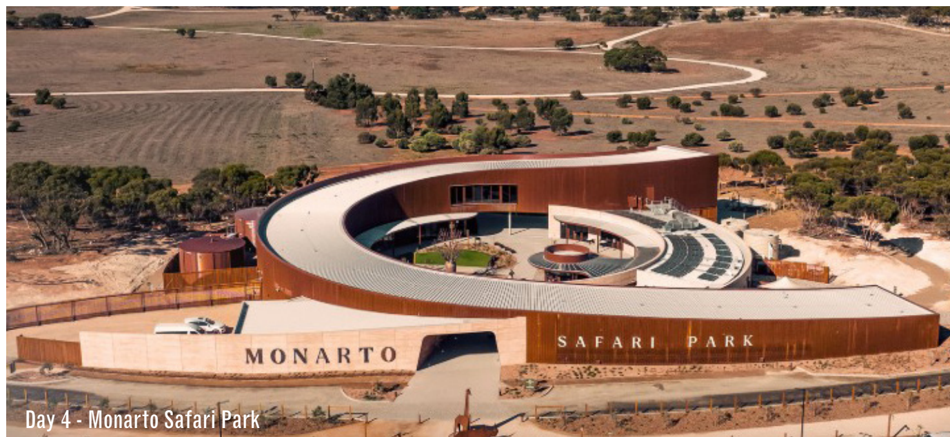
Day 4 - Monarto Safari Park