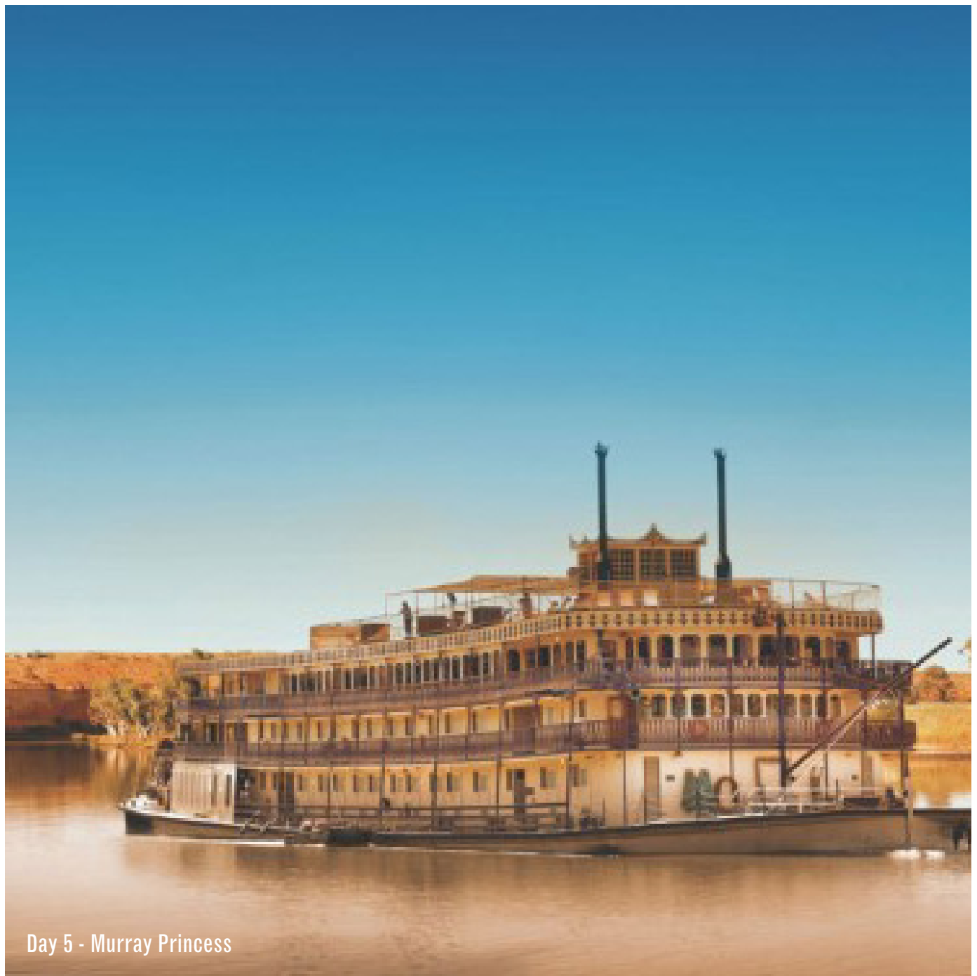
Day 5 - Murray Princess