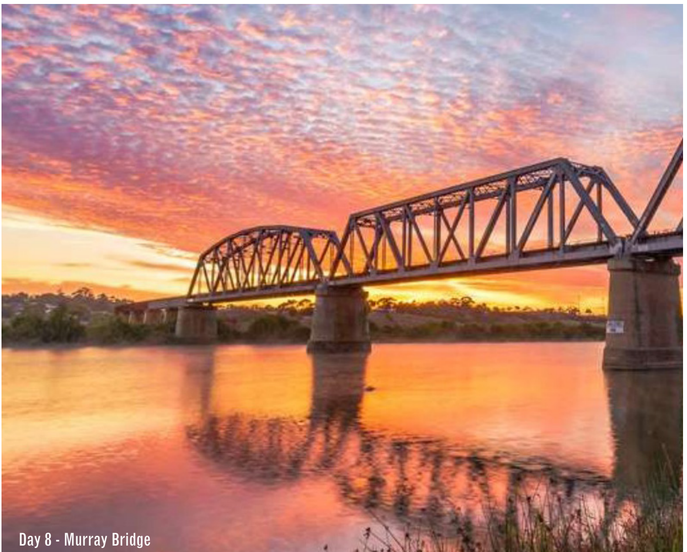
Day 8 - Murray Bridge