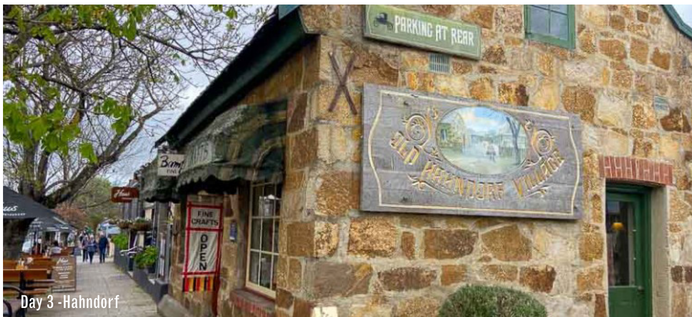
Day 3 - Hahndorf